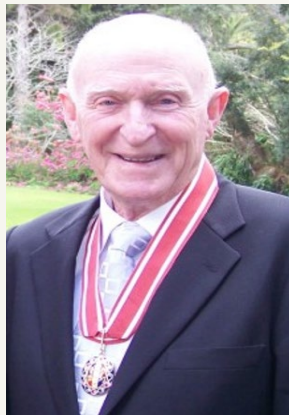
Sir Murray Halberg