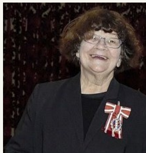
Dame Joy Cowley