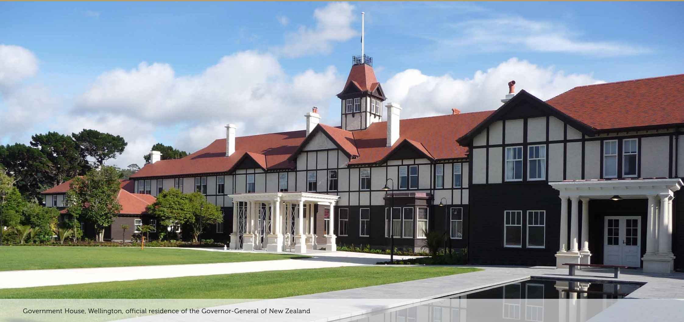
Government House, Wellington, official residence of the Governor-General of New Zealand